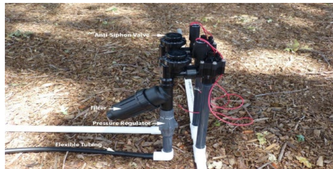
Pressure Regulators and filters